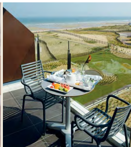
"Exclusive" room with balcony and a partial water view