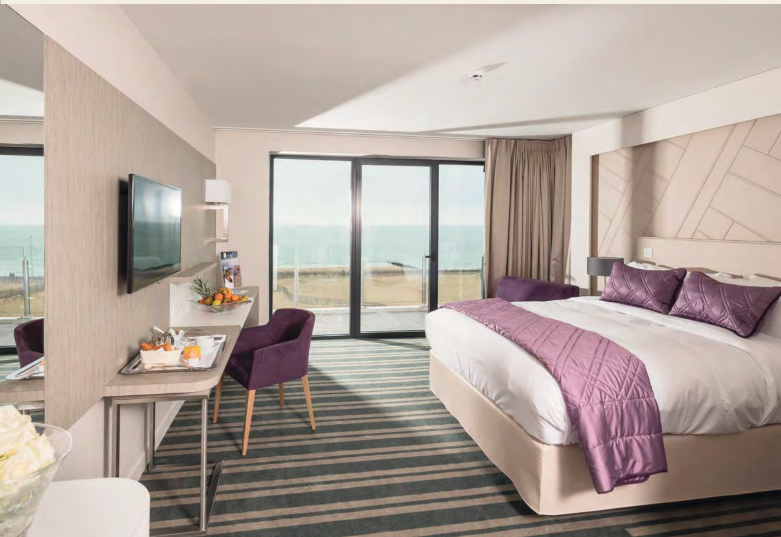
"Exclusive" room overlooking the water - "Privilege"